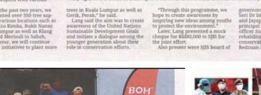
Mahasiswa FPAS bersama-sama ahli SHGSU dalam memproses data kelestarian alam sekitar.