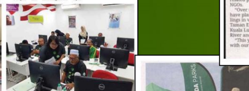
Mahasiswa FPAS bersama-sama ahli SHGSU dalam memproses data kelestarian alam sekitar.