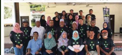
Presyd dan Pengerusi FPAS bersama-sama ahli SHGSU yang terlibat pada program di kawasan hutan paya gambut.

Program ini akan melibatkan komuniti dalam menguruskan hutan paya gambut. Beliau juga berharap projek ini dapat meningkatkan pengetahuan dan kemahiran komuniti dalam menguruskan hutan paya gambut.