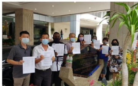
The residents of Continental Heights Condominium and Taman Gembira submitting their latest petition to DBKL today.

PETALING JAYA: Residents who were told by Kuala Lumpur City Hall (DBKL) to return with a more robust petition to stop the construction of a road have done just that, reaching the benchmark set by DBKL in just six days.