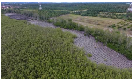
10,600 mangrove trees planted in Sungai Limau, Manjung Perak.