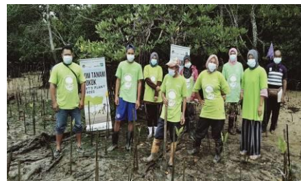
Small-scale mangrove planting activity by PSHBPTS as at Pulau Tanjung Surat, Johor