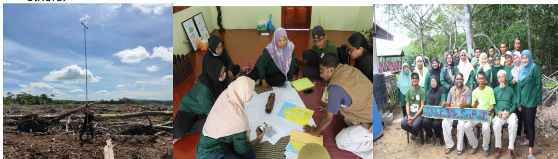
Field assessment at Bukit Belata (left), Training was organized for SHBPTS members on the development of local tourism products in Pulau Tanjung Surat (centre), mangrove rehabilitation by SHBPTS at Tanjung Surat (right)