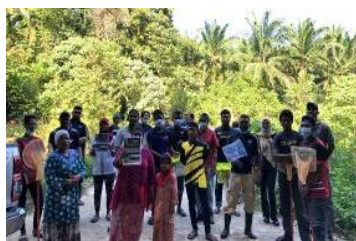
Suluh, Ulu Kinta

For the UKB project, one online webinar on Community River Monitoring was conducted on 14 May for local communities and agencies, focusing on sharing of community monthly river monitoring data and current river status in Malaysia and Perak due to MCO. The first training for the Orang Asli community on RIVER Ranger 2.0 programme was conducted on 21 June.