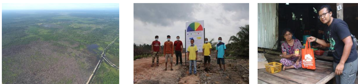
Extension of rehabilitation to Pekan Forest Reserve (part of Southeast Pahang Peatland Landscape (left). FDRS signboard installation and on-site briefing (centre). Food supply contributed to the OA community (right)

The rehabilitation programme at Bukit Leelau Mini Landscape area and Pekan (Extension) Forest Reserve is ongoing and has been expanded to nearby peat areas with continued support from the Bursa Bull Charge (BBC) and United Nations Development Programme (UNDP) OA Micro Grant Facility and IFAD supported TAKE-SMPEM. The landscape has been fire-free for 16 months resulting from rehabilitation activities and awareness programs with the local OA community. Further work has been undertaken in Q2, including assessing for possible extra sites and developing a plan for the rehabilitation work including constructing another canal block in a new area with a critical history of fire (in HS Pekan). The nearby OA community was engaged for fire prevention in as part of a new partnership of the community. During the RMCO period, GEC distributed food supplies to 16 OA families as well as 9 kitchen sets (stove and gas tank) in order to support the community welfare and reduce reliance on wood for cooking.