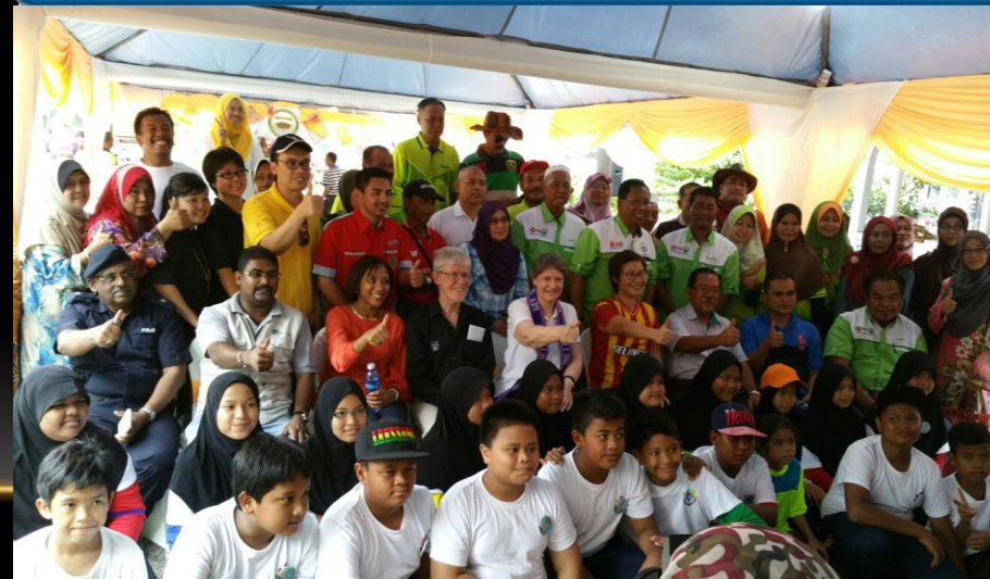
Received Visitor from International