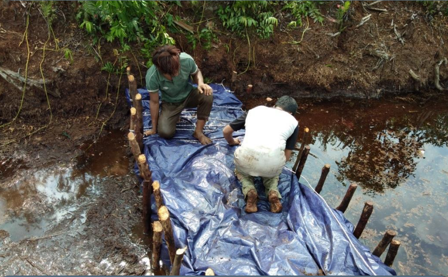
Involve in Canal Blocking Construction