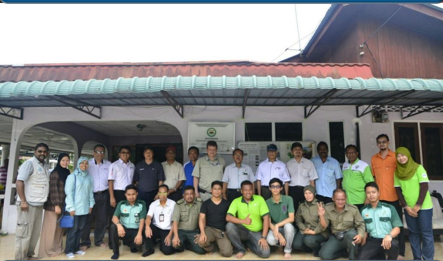
Received Visitor from Local