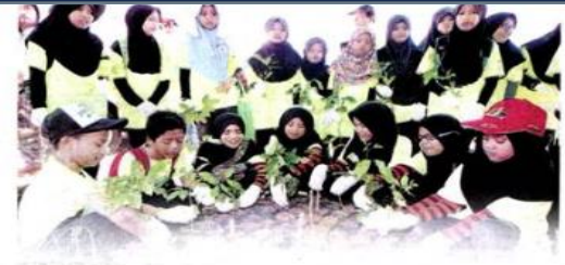
Students planting a "Tenggok Burung" sapling in the run-up to the 2nd Conference of the Parties (COP22) at the Raja Musa Forest Reserve in Bontor Ajay, Selangor, recently.