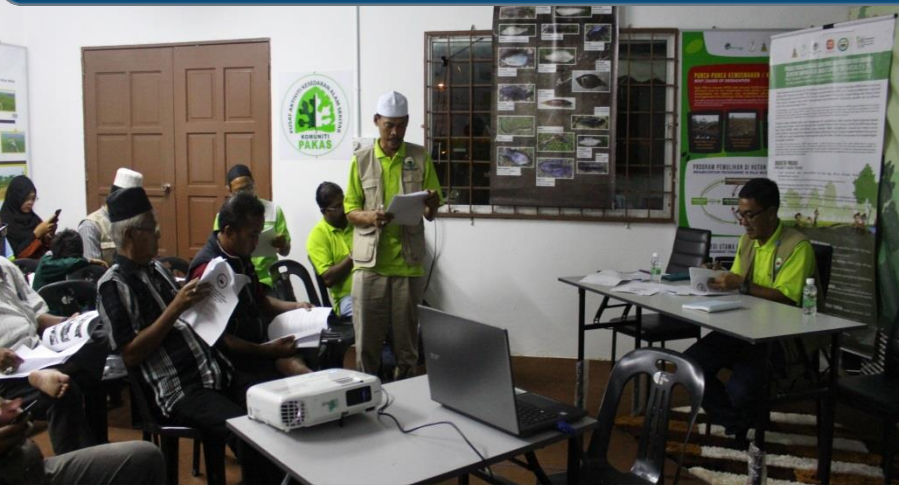
Annual General Meeting