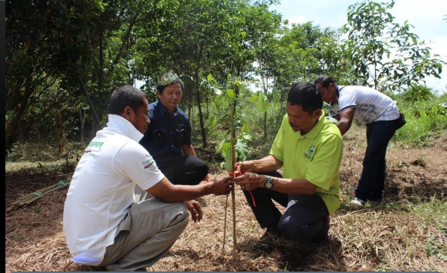
Facilitator at Tree Planting Programme