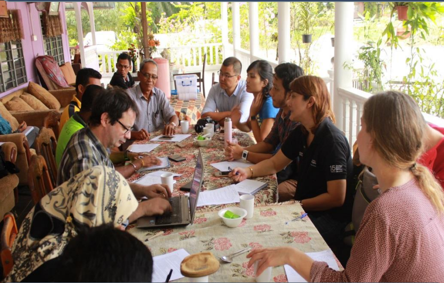
SHGSU Exposed & Involve in Academic Research