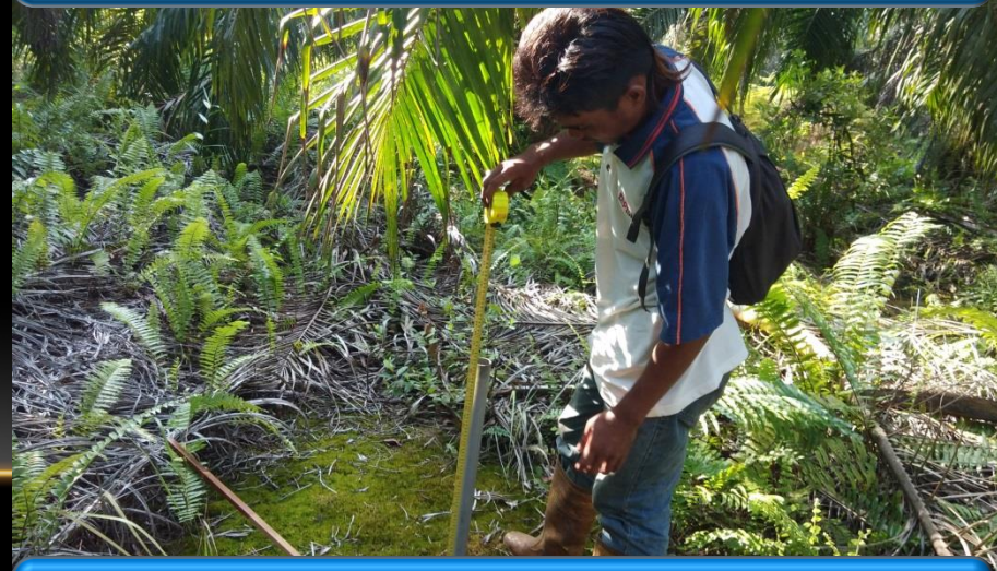
Collecting Water Table