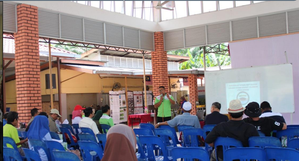
Delivery Talks & Being Speaker During Official Visit and Programme