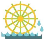
Water Thimble Tech