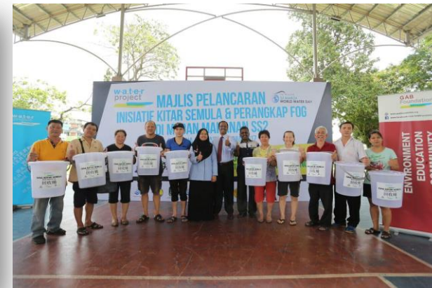
BUSINESS COMMUNITY TRAINING PROGRAMME