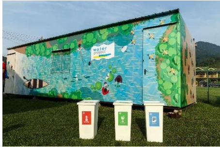
MRCU & RIVER CARE CENTRE