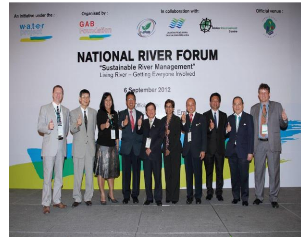
NATIONAL RIVER FORUM