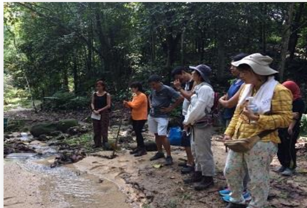
RIVER MONITORING & ADOPTION