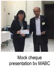
Mock cheque presentation by MABC

Under the ROLPOP5, a post perception survey conducted in February 2020 to analyse the effectiveness of past/ongoing ROLPOP5 programmes and is expected to be completed by May 2020. OPP and FCP are also working on strategic platforms to promote and market community handicraft products using online and social media mediums. Under this initiative, a training conducted in collaboration with Asian Banking School (ABS) for SHGKLU Orang Asli handicraft group on products development. During this period, GEC received donation from the Malaysia-Australia Business Council and Dentsu/Lemonade from their fundraising initiative for GEC.