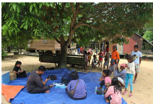
Visit to Kg Padang in March 2020

GEC has signed project contracts with Yayasan Gambut (the GEC Indonesia programme) for some work under IFAD-funded TAKE-SMPEM and APMS Review that involve works in Indonesia.