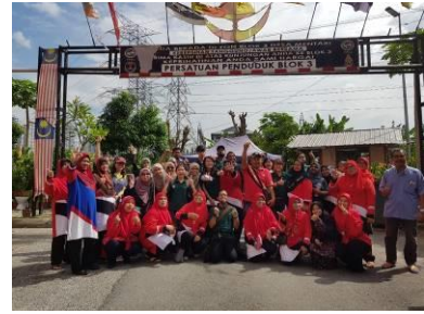
Study visit from Penang Green Council

In February and March 2020, GEC organized an online campaign and media visibility against the Selangor Government's proposed de-gazettement of KLNFR. The campaign successfully received more than 14,000 objections from the public more than 30 media coverages.