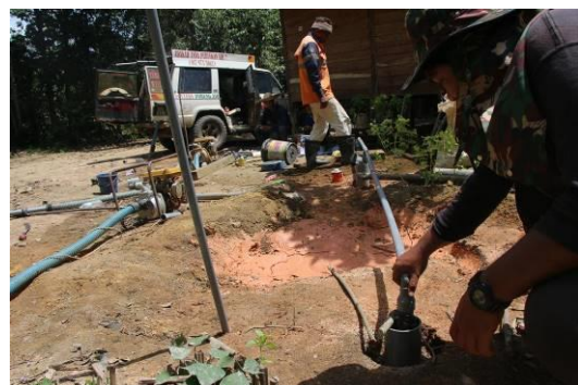
Tubewell drilling for the 2-in-1 solar system in Kg Melogo