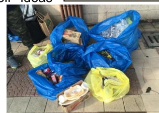
Thaipusam BMP Materials and Waste Audit Study