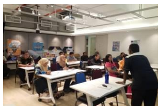
CLEAN BMP Sharing Session with DOE WPKL

As for River of Life Public Outreach Programme Phase 5, activities were focused on engaging the public and the food operators under the best management practices during festivals – i.e. during the Thaipusam festival. Best management leaflets, poster, information sharing and engagement were carried out with support from DBKL and the Sri Maha Mariaman Temple Committee, together with Alam Flora and SWCorp. The GEC team also conducted three spot-based waste audit studies during the Thaipusam chariot procession to have a better idea on the waste characteristics. The waste audit was to determine the impact of the festival in terms of waste in order to target future action and BMP initiatives. Beside this, a Best Management Sharing Workshop was conducted for Industries and Automobile Workshop with the support of Department of Environment (DOE) WPKL. Prominent speakers from various industries as well as workshop players who are practicing the BMP