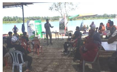
Outreach activity at ORS Bestari Jaya

For the first quarter, the W.A.T.E.R. project focused mainly on initiatives in Selangor River Basin. The biggest initiative was the construction of a 300m clay dyke in Raja Musa Forest Reserve (RMFR), which was completed in January 2020. The aims of the clay dyke are, a) water retention during the wet season for slow release especially during dry weather, and b) peatland fire prevention. The first GEC Lake Information Centre was set up in