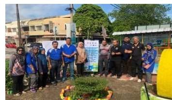
Community Recycling Corner Launching and Mural Painting

Under the Upper Kinta Basin (UKB) Management project, the project focused on community initiatives and monitoring as well as to supporting community livelihood. KRT Taman Tasek Jaya launched their Community Recycling Corner on 15 February 2020 to increase awareness among the community on the importance of proper waste management as part of pollution reduction. The programme received good participation and support from local communities and agencies. The community also organized an outreach programme with kindergarten students on 13 March