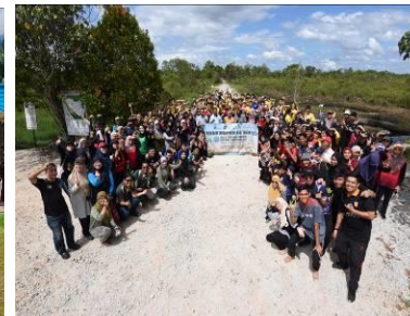
Press conference for the Save Kuala Langat North Forest Reserve (left and centre). World Wetlands Day Celebration 2020 (right)

The following activities were successfully implemented before the MCO ruling: -