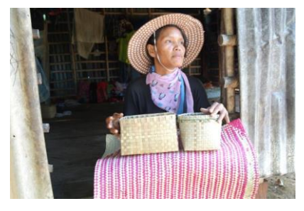
Alternative sustainable livelihood (community nursery, honey and handicrafts) for orang asli community of Kg. Taniung Kelapa