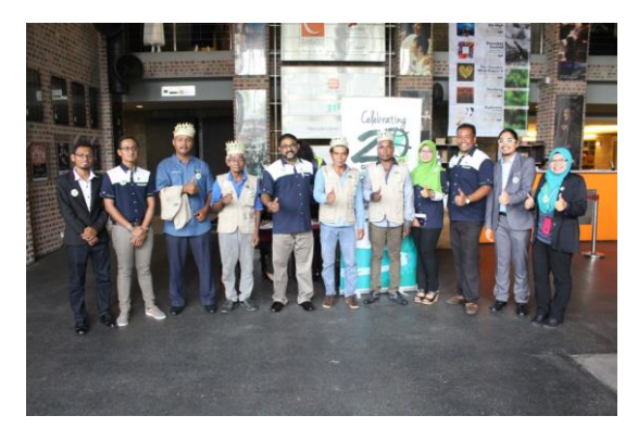
GEC Anniversary Forum on 23 Apr 2019