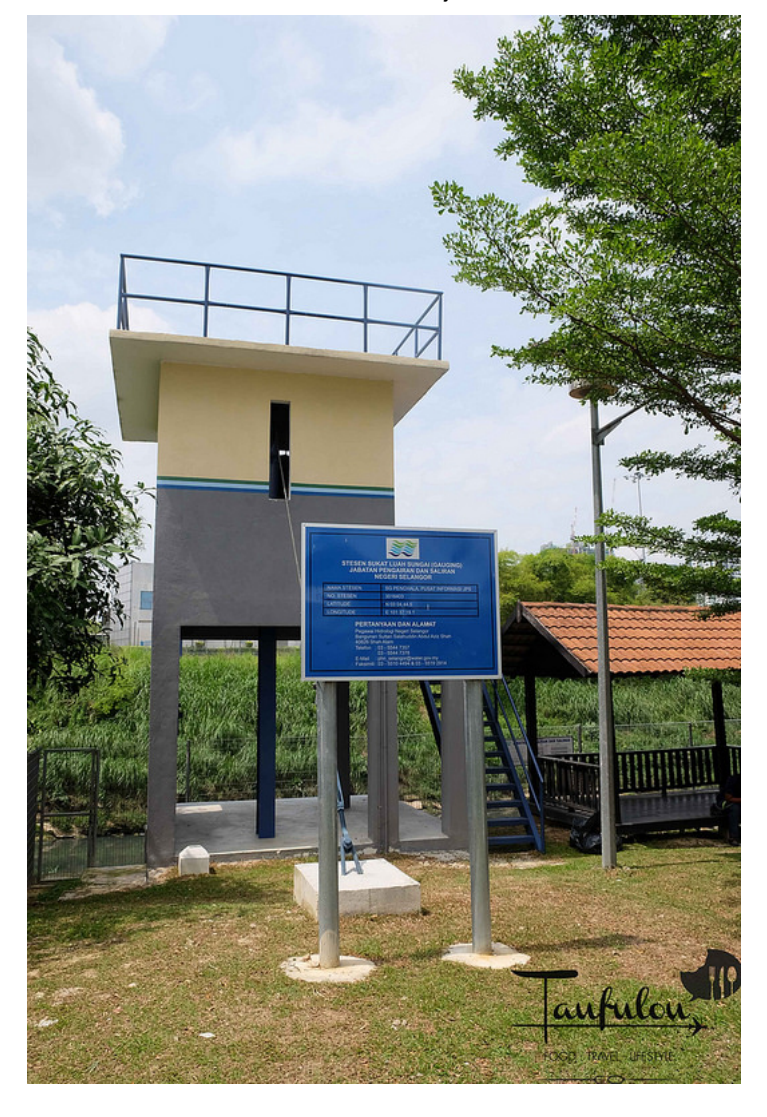
This is the Pusat Informasi and Pengairan dan Saliran at PJ