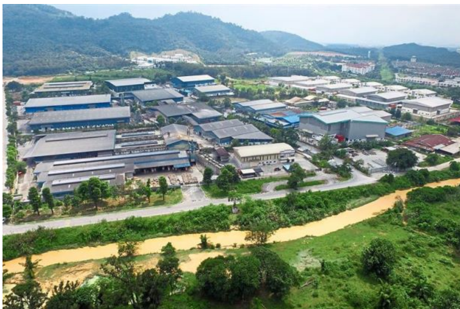
An aerial shot of Sungai Semenyih shows the close proximity of factories in Jalan Villaraya 3 to the river.