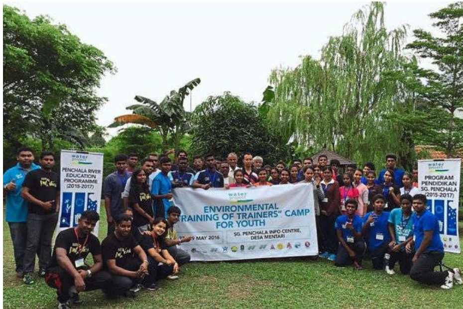
The participants posing for a group photo during the programme.